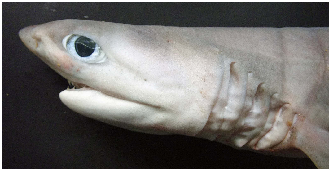
Fig. 3. A close up of head with seven gill slits and large eye of sharpnose sevengill shark.

Morphometric measurements are presented in Table 1. The specimen was identified as H. perlo due to the presence of seven pairs of gill slits with the first pair longer than the others. Other features were: slender and fusiform body with a unique dorsal fin located backward, long upper lobe of the caudal fin, pointed head and rather large and fluorescent blue