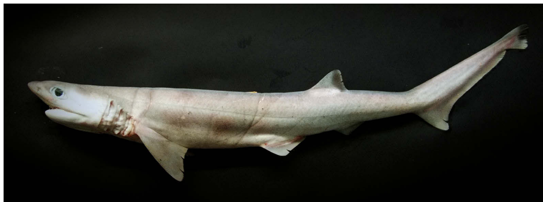
Fig. 2. Immature female of sharpnose sevengill shark, captured in waters off Slovenia on 21 st December 2021.

morphometric measurements were taken. The body surface and the branchial region of the shark were carefully examined for the presence of ectoparasites. Samples of muscle and liver of the shark were preserved for studies on bioaccumulation of pollutants. After that, the specimen was photographed and dissected in order to analyse its stomach contents. The remains of prey items found in the stomach were isolated and rinsed with seawater and preserved in 80% alcohol. The hepatosomatic index (HSI) was calculated by the formula (sensu Capapé 1980): HSI = (LM/TM) \times 100 , LM is the total liver mass (g) and TM is the total body mass (g). We calculated also the condition factor using the formula of Tanaka & Mizue (1977): Kc = (TM \cdot 10^3) / (TL)^3 . Kc is the condition index, TM is the total body mass (g) and TL