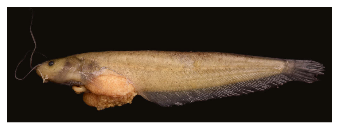
Fig. 8. Silurus longibarbatus, uncatalogued, 90 mm SL, mature female with stage IV eggs.

The new species is most similar to Silurus duanensis (Fig. 6) in body shape. These two species are also distributed in close geographic proximity to one another. However, the new species can be distinguished from the latter as having a shorter head (16.6–19.3 % SL vs. 21.3–23.3), vomerine teeth in a single continuous band (vs. vomerine teeth in two discrete patches), caudal fin rounded (vs. emarginate or truncate), posterior nostrils with elongated triangular flap (vs. tubular nostrils) (Fig. 7), completely confluent anal and caudal fins (vs. notch between the otherwise confluent anal and caudal fins), 8 (vs. 10–12) gill rakers and 42–44 (vs. 56 or 57) vertebrae.