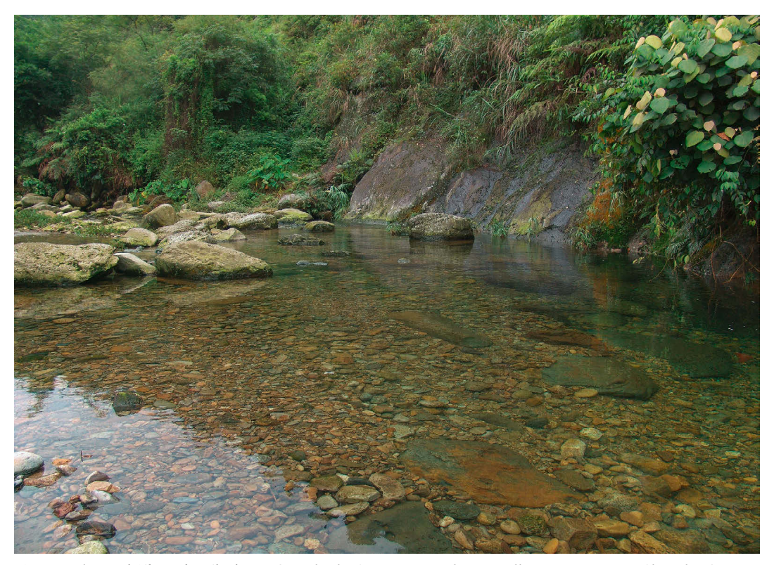
Fig. 5. Habitat of Silurus longibarbatus . Qingshuihe Stream in Yunhuang Village, Xiyan Town, Shanglin County, Guangxi, China.

as having two pairs (vs. one pair) of mandibular barbels, mandibular barbel reaching the pectoral-fin origin (vs. mandibular barbel not reaching the pectoral-fin origin), 50–58 (vs. 71–85) anal-fin rays, and 42–44 (vs. 50–52) vertebrae. The new species can be distinguished from S. aristotelis by having 50–58 (vs. 75) anal fin-rays, a shorter head that is 16.6–19.3 % SL (vs. a longer head, 24.4 % SL), maxillary barbel extending far beyond the