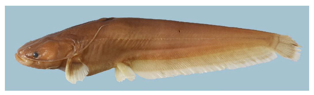
Fig. 6. Silurus duanensis, PRFRI 01050247, 86.0 mm SL; China: Guangxi: Pearl River drainage.

pectoral-fin base (vs. maxillary barbel not reaching the pectoral-fin base), and a smooth anterior margin of the pectoral-fin spine (vs. strongly serrated anterior margin of the pectoral-fin spine). Silurus longibarbatus can be distinguished from S. lithophilus by having 2 or 3 (vs. 4 or 5) dorsal-fin rays, 8 or 9 (vs. 9–11) pelvic-fin rays, 50–58 (vs. 77–82) anal-fin rays, and a smooth (vs. strongly serrated) anterior margin of the pectoral-fin spine.