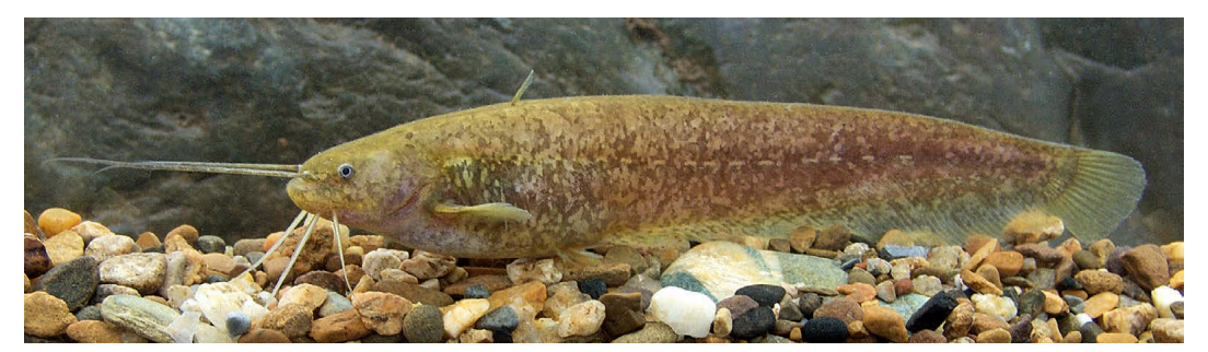
Fig. 3. Live coloration of Silurus longibarbatus, uncatalogued, 123 mm SL; China: Guangxi: Pearl River basin.

Diagnosis. Silurus longibarbatus is distinguished from all congeners by the following combination of characters: three pairs of relatively long barbels; 2 or 3 dorsal-fin rays; 50–58 anal-fin rays; 42–44 vertebrae; head length 16.6–19.3 % SL; pectoral-fin spine with smooth anterior and serrated posterior margins; vomerine teeth patches in continuous band; and lateral line visible as a series of short whitish horizontal lines.