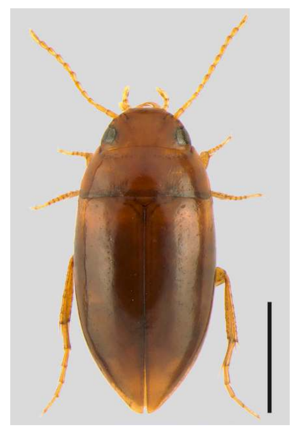
Fig. 1. Hydrodytes opalinus (Zimmermann, 1921) habitus female in dorsal view (total length 2.75 mm). Scale bar: 1 mm.