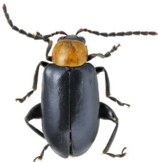
Fig. 1. Female of Luperomorpha xanthodera from Russia, city of Sochi, the Black Sea shore, dorsal view.

Malo, which is connected with Great Britain with many ship lines (Doguet 2008). In 2006 L. xanthodera was recorded to be common in two localities in Italy (Conti & Raspi 2007). Now it is widely spread over France (Vincent & Doguet 2011), Germany (Döberl & Sprick 2009) and The Netherlands (Beenen et al. 2009), and occurs also in Switzerland (Döberl & Sprick 2009), Hungary (Bodor 2010, 2011), Belgium (Fagot & Libert 2016), Austria (Geiser & Bernhard 2012) and Poland (Kozłowski & Legutowska 2014). Luperomorpha xanthodera is definitely established in France and Italy, but it is unclear, if it is established in other European countries, since all findings were made in or near garden-centers or on recently imported plants. We have found L. xanthodera much east of all previously known localities in Europe, namely in Sochi (Russia).