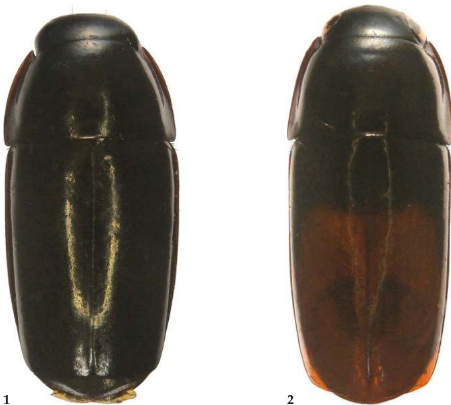
Figs 1-2. Habitus. Body lengths in brackets. 1. Adelotopus nigerrimus , spec. nov. (5.6 mm). 2. Adelotopus mutchillbae , spec. nov. (5.4 mm).