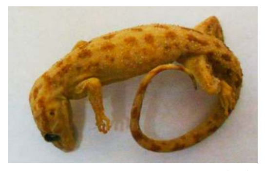
Fig. 2. Dorsal view of the only known male Cyrtodactylus celatus (ZSM 556/2002). SVL = 41.4 mm.

margin of retroarticular process of lower jaw; head width (HW) 7.8, at the angle of the jaws; head depth (HD) 5.2, as maximum depth of head from occiput to throat; eye-snout distance 5.2, from tip of snout to anterior most margin of eye; eye-ear distance (EyeEar) 4.6, from posterior edge of ear opening to posterior margin of eye; orbital diameter (OrbD) 2.6, as maximum eye diameter; ear length (EarL) 0.8, as distance from anterior edge to posterior edge of ear. The following ratios are provided for an assessment of relative body dimensions: TL/SVL 1.18, HL/SVL 0.27, HW/HL 0.71, HD/HL 0.47, EyeEar/HL 0.51, OrbD/HL 0.24, EarL/HL 0.07.