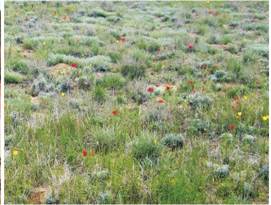
Fig. 11. Type locality (Gorkaya river in the Astrakhan Distr., arrowed, left) and a biotope of the new species in the Bogdo-Baskunchak Nature Reserve (right).

no scorpions were found where centipedes lived and no centipedes were found under stones where scorpions lived. In the Orenburg region the species was collected in the Sol'-Iletsy district in soil traps on saltmarsh (Farzalieva & Esyunin 2008).