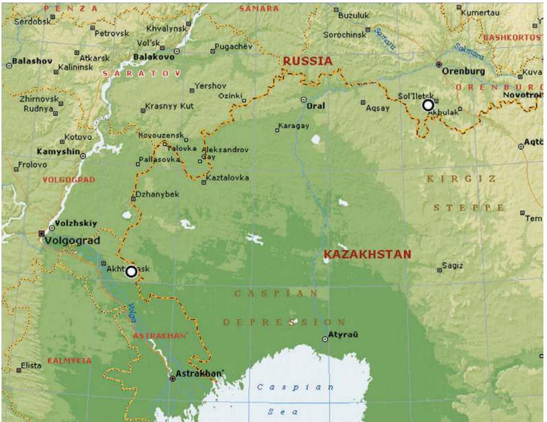
Fig. 10. Known distribution of Hessebius scythodes spec. nov.

pores being equal to the diameter of the neighbour pores or slightly larger) prove that the species is conspecific to that described as H. scythodes . Also in the north of the Kalmyk Republic, on the saltmarsh Arshan-Zel'men, an undescribed lithobiid species was discovered about 60 years ago (Gilyarov & Folkmanova 1957: 216). It is assumed that these specimens are also identical with Hessebius scythodes .