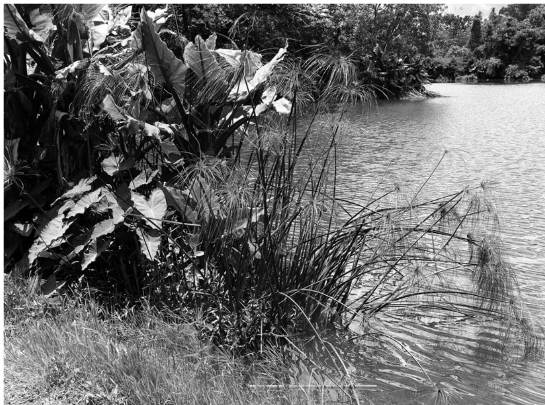
Fig. 2. Habitat of Scolopendra antananarivoensis spec. nov. near Antananarivo, Madagascar.