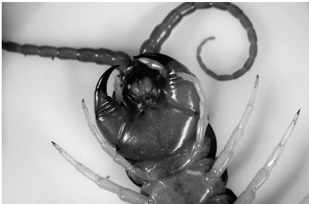
Fig. 6. Scolopendra antananarivoensis spec. nov., ventral view of the head and the first pairs of locomotory legs.

tergit is between 81-107 mm with a maximum tergite width of 9 mm (tergit 12 in the holotype).