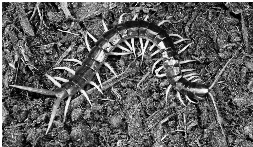
Fig. 3. Scolopendra antananarivoensis spec. nov., complete view.