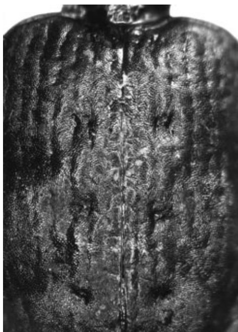
Fig. 3. Scopodes arfakensis , spec. nov. Microstructure of the elytra.

remarkably irregular around the discal foveae. Due to the strong microreticulation surface comparatively dull. Pilosity sparse, erect, very short. Marginal pores comparatively large, contrastingly coloured. Metathoracic wings very short.