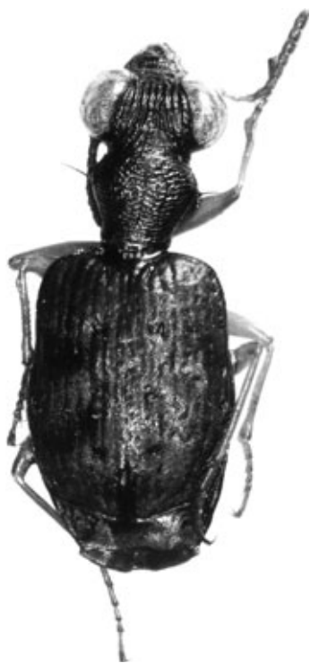
Fig. 1. Scopodes arfakensis , spec. nov. Habitus. Body length 3.5 mm.

The habitus photographs were obtained with a digital camera using ProgRes CapturePro 2.6 and Auto-Montage and subsequently digitally processed with Corel Photo Paint 11.