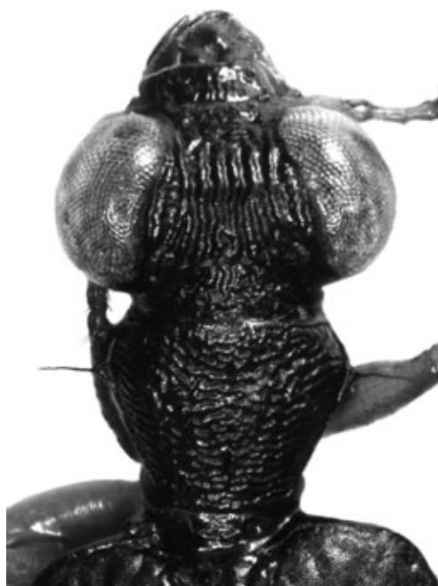
Fig. 2. Scopodes arfakensis , spec. nov. Head and pronotum.