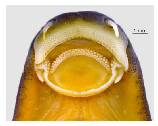
Fig. 2. Gara mini , DU 70001, holotype, 44.4 mm SL; Bangladesh: Shuvolong Falls; ventral aspect of mouth.

sent from chest to level of end of base of pectoral fin; scales present on abdomen, minute, thin, partly non-imbricated, covered by skin; scales imbricated and clearly visible posterior to pelvic-fin insertion, with about 5–6 small elongate scales in midline between pelvic-fin insertion and vent. On predorsal midline about 14–16 very small scales embedded in skin, without free margin.