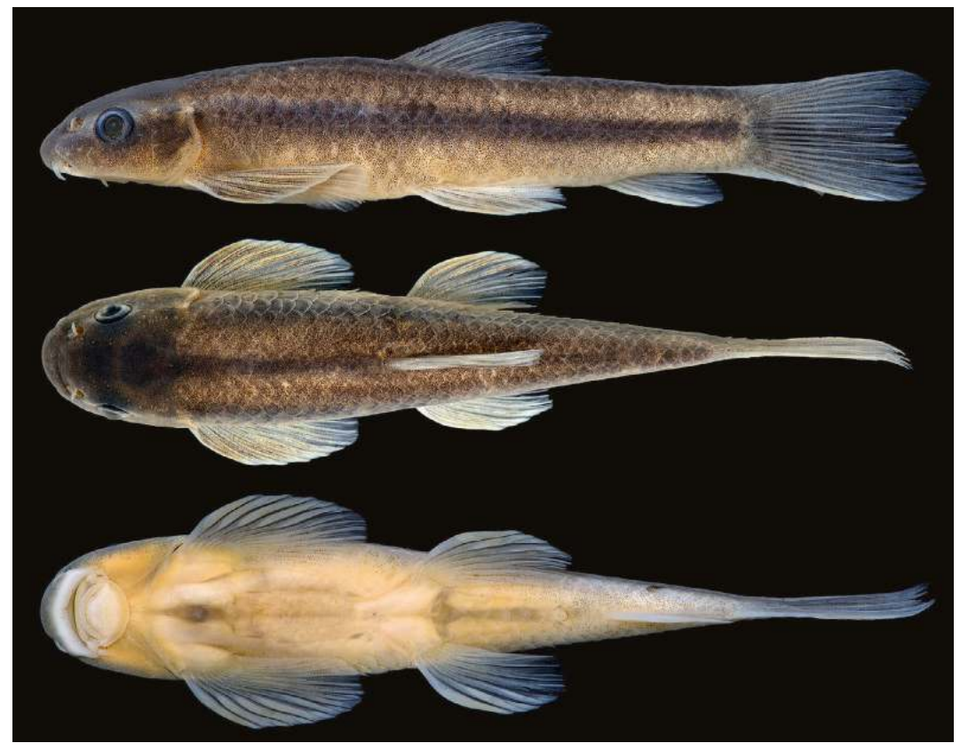
Fig. 1. Garra mini, holotype, DU 70001, 44.4 mm SL; Bangladesh: Shuvolong Falls.