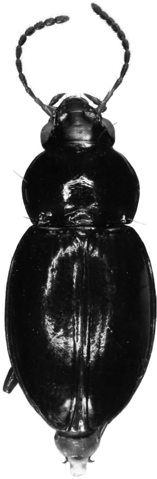
Fig. 1. Sloaneana curvicollis , spec. nov. Habitus. Body length: 3.9 mm.

Sloaneana Csiki, 1933: 1651 (nom. nov. for Sloanelia Csiki, 1928). – Moore et al. 1987: 123; Baehr 2002: 9; Lorenz 2005: 201; Eberhard & Giachino 2011: 3.