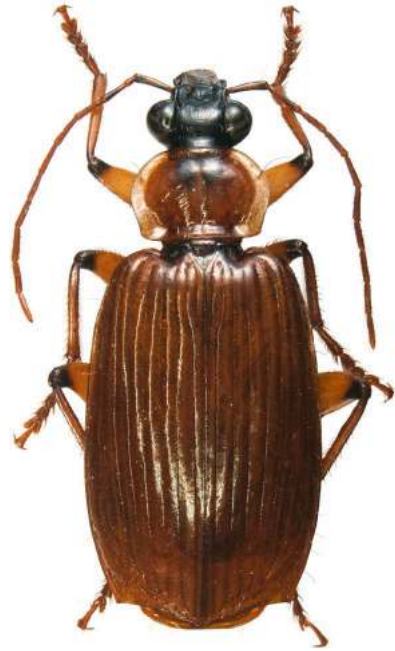
Fig. 3. Aristolebia rutilipennis , spec. nov. Habitus. Body length 13.5 mm.

Head (Fig. 3). Of moderate size. Eyes very large, semicircular, laterad remarkably protruded, orbits barely perceptible. Neck with fairly shallow transverse impression. Labrum anteriorly straight, 6-setose, surface widely depressed. Mentum with shallow, apically slightly rounded convexity. Glossa