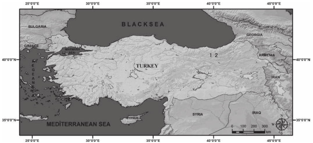
Fig. 1. Research area. 1: Gümüşhane province; 2: Bayburt province.

center), GŞİ (Gümüşhane, Şiran district), GKE (Gümüşhane, Kelkit district), GTO (Gümüşhane, Torul district), GKÜ (Gümüşhane, Kürtün district), GKÖ (Gümüşhane, Köse district), BME (Bayburt, center), BAY (Bayburt, Aydıntepe district), BDE (Bayburt, Demirözü district).