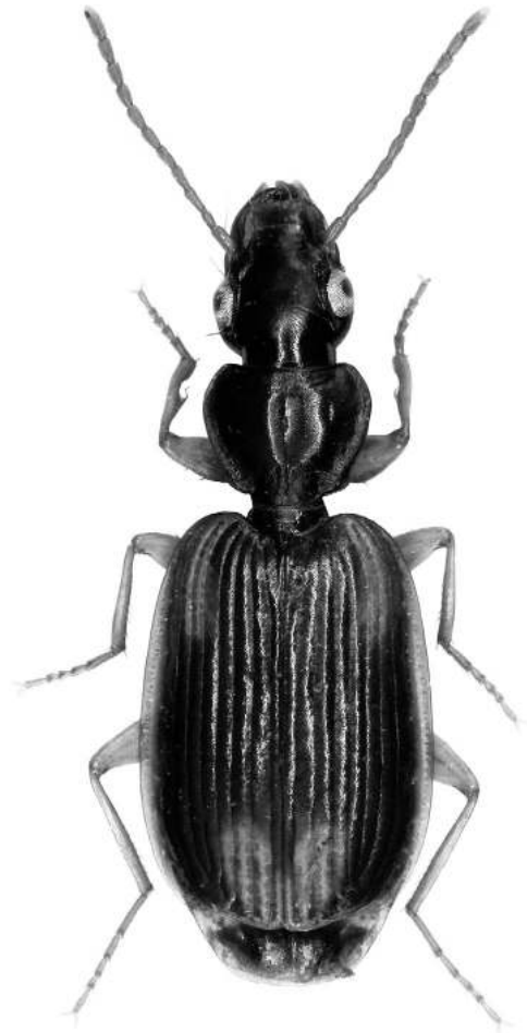
Fig. 2. Anomotarus andamanicus , spec. nov. Habitus. Body length 4.9 mm.

Measurements. Length: 4.4–5.0 mm; width: 1.75–2.05 mm. Ratios. Length eye/orbit: 2.2–2.4; width/length of pronotum: 1.21–1.25; width widest diameter/base of pronotum: 1.32–1.38; width pronotum/head: 1.18–1.23; length/width of elytra: 1.42–1.46; width elytra/pronotum: 1.60–1.72.