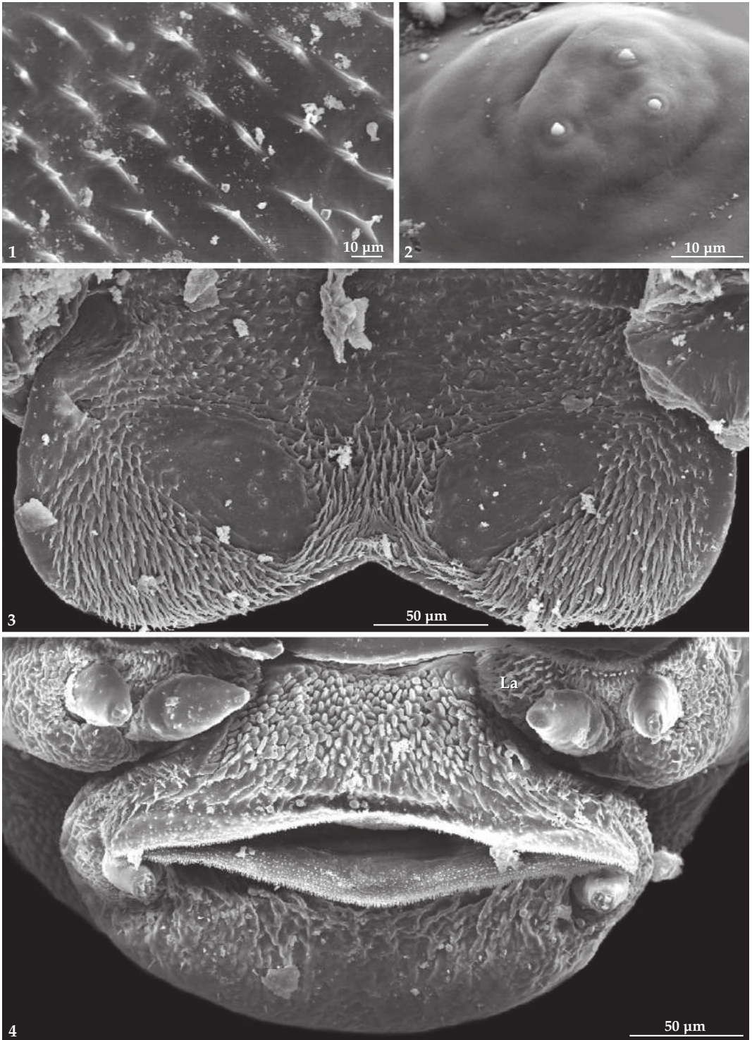
Figs 1-4. Last instar larva of Prionyx thomae (scanning electronic microscopy). 1. Integument of the body; 2. antennal orbits; 3. epipharynx; 4. oral portion (La = lacinial area).