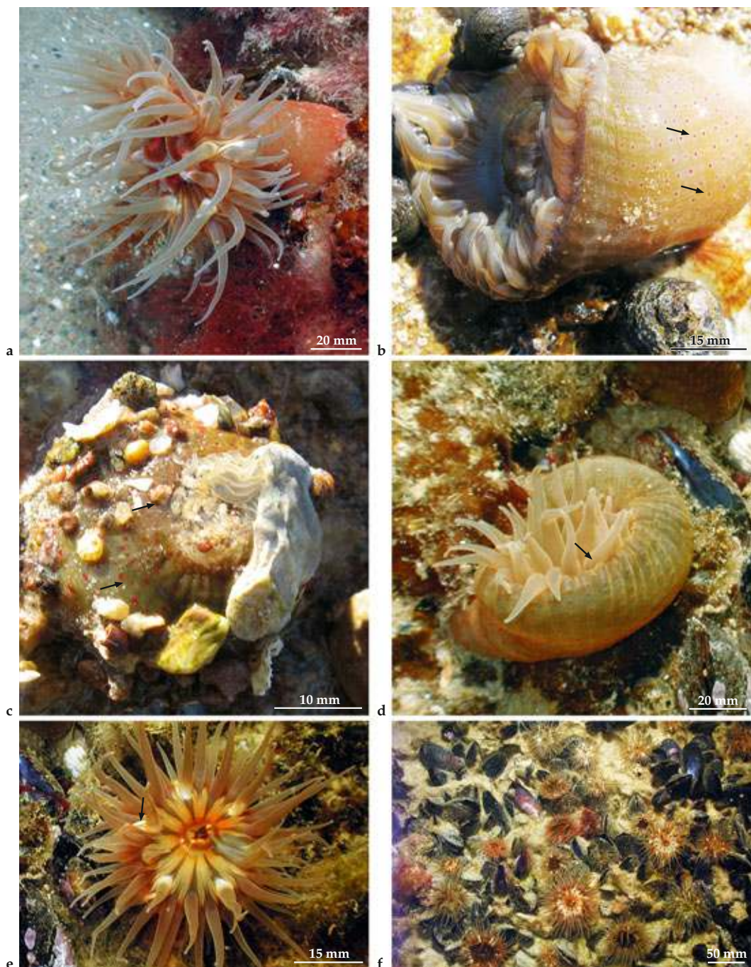
Fig. 2. Parabunodactis imperfecta in the habitat. a,b. Lateral view. Arrows in B indicate vertical line of verrucae. c. Specimen fallen dry in the intertidal. Arrows point to verrucae and attached material. d. Partly retracted specimen. Arrow points to pseudoacrorhagi. e. View of the oral disc. Arrow indicates light lines leading around the base of the tentacles of the first cycle. f. Group of specimens between mytilids. Photographs a, d, e and f in Punta Pardelas at 4-5 m depth. Photos b and c in the intertidal zone of Las Grutas.