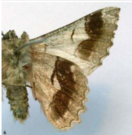
Figs 4-6. Hypobapta percomptaria (Guenée, 1858), Tasmania. 4, upperside; 5, underside; 6, holotype, underside. Scale bar = 1 cm.