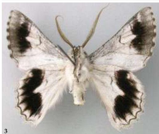
Figs 2-3. Hypobapta tachyhalotaria sp.n., Holotype, Tasmania. 2, upperside; 3, underside. Scale bar = 1 cm.

firmed species. While it is clear that those mainland Australian specimens cannot be H. percomptaria , they are here only provisionally grouped with H. tachyhalotaria , until a revision of Hypobapta on the basis of a much larger sample clarifies the taxonomic situation in this respect.