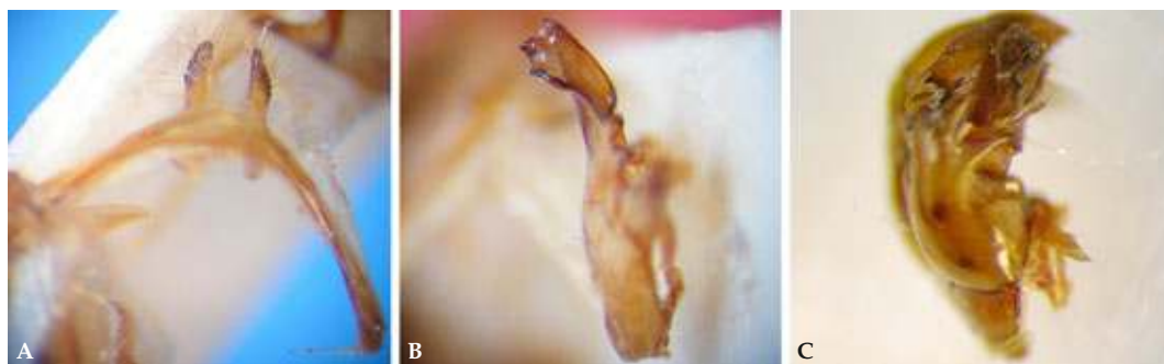
Fig. 2. Genitalia of male Eufriesea heideri spec. nov. A. Sternum 7. B. Sternum 8. C. Genital capsule.

mens. The holotype (male) is currently deposited at UFMG, the only paratype is housed at the ZSM. Terga and sterna are referred to as T1, T2, T3, etc., and S1, S2, S3, etc. Integument and setae coloration were described by eye using a Leica MZ12 microscope. Measurements were taken from the holotype, except of the S7 and the genitalia which were taken from the only paratype (in order to keep the holotype intact). The tongue length was measured following Kimsey (1982: 10), which is “the length of the basal two segments of the labial palpi, from the basal fold, normally resting behind the mandibles, to the two apical segments of the labial palpi”.