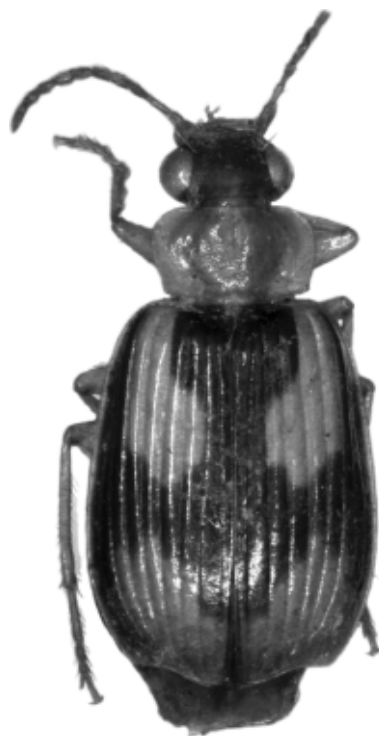
Fig. 2. Lebia edentata , spec. nov. Habitus. Body length: 6.3 mm.

Female genitalia. Stylomeres of typical Lebia -like shape: stylomere 2 short, apically rounded, both stylomeres devoid of any setae.