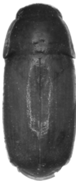
Fig. 2. Adelotopus parrotti , spec. nov. Habitus. Length: 5.0 mm.

♂ genitalia (Fig. 1). Genital ring rather wide, convex, fairly asymmetric, left arm convex, right almost straight, with elongate apex and slightly asymmetric, narrow, little excised base. Aedeagus rather short, fairly depressed, in middle considerably widened, slightly asymmetric. Basal part rather long, moderately bent. Lower surface gently convex, not perceptibly striped. Apex moderately wide, evenly rounded off, rather symmetric. Orifice