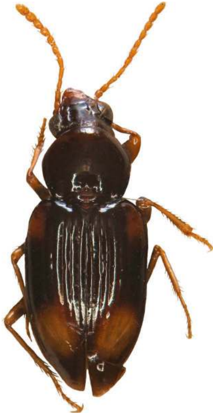
Fig. 1. Tachyura patruelis , spec. nov. Habitus, body length: 2.7 mm.