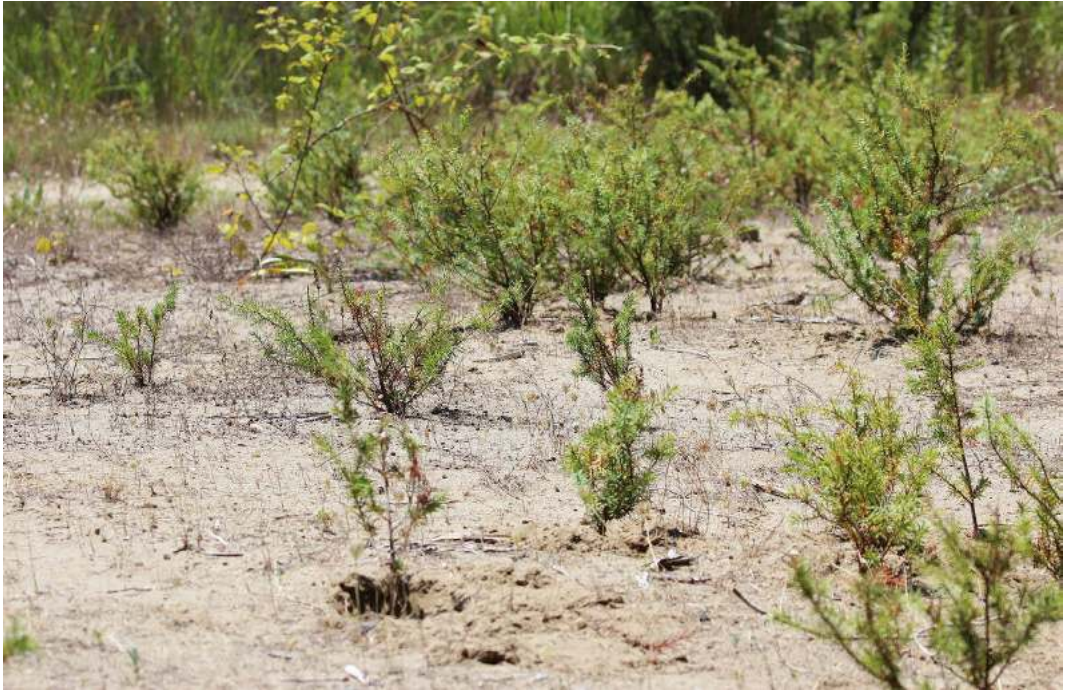
Fig. 2. Habitat of species S. baetica and A. occitanica in Divjakë, Albania.