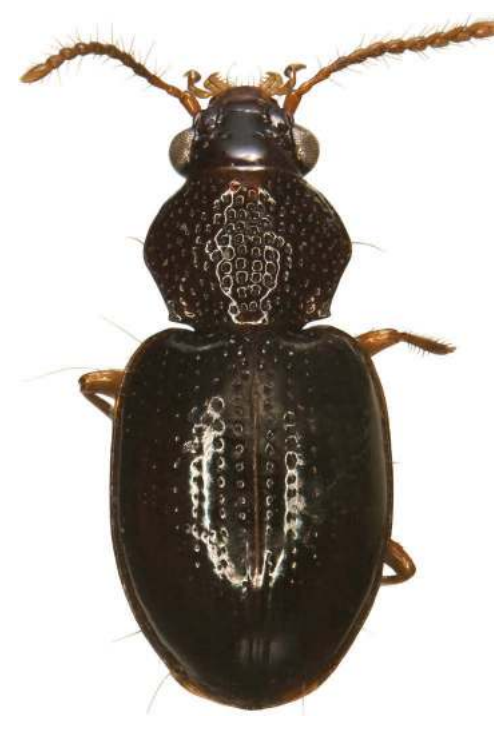
Fig. 1. Mecyclothorax punctatus peckorum, subspec. nov. Habitus. Body length: 2.8 mm.

photograph was obtained by a digital camera using ProgRes CapturePro 2.6 and AutoMontage and subsequently was edited with Corel Photo Paint 14.