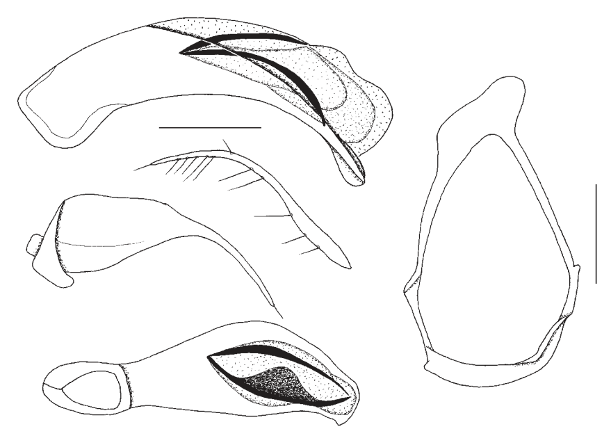
Fig. 2. Mecyclothorax punctatus peckorum, subspec. nov. Male genitalia: aedeagus, left side and lower surface, right and left parameres, genital ring. Scale bars: 0.25 mm.

nomere. Posterior supraorbital seta located slightly in front of posterior margin of eye. Only labrum distinctly microreticulate, rest of surface glabrous and very glossy.