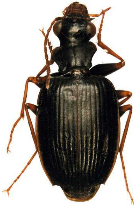
Fig. 1. Mochtherus dentatus , spec. nov. Habitus. Body length: 7.9 mm.

cleaned for a short while in 10 % KOH. The habitus photograph was obtained by a digital camera using ProgRes CapturePro 2.6 and AutoMontage and subsequently was edited with Corel Photo Paint 14.