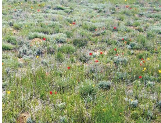
Fig. 11. Type locality (Gorkaya river in the Astrakhan Distr., arrowed, left) and a biotope of the new species in the Bogdo-Baskunchak Nature Reserve (right).

no scorpions were found where centipedes lived and no centipedes were found under stones where scorpions lived. In the Orenburg region the species was collected in the Sol'-Iletsk district in soil traps on saltmarsh (Farzalieva & Esyunin 2008).