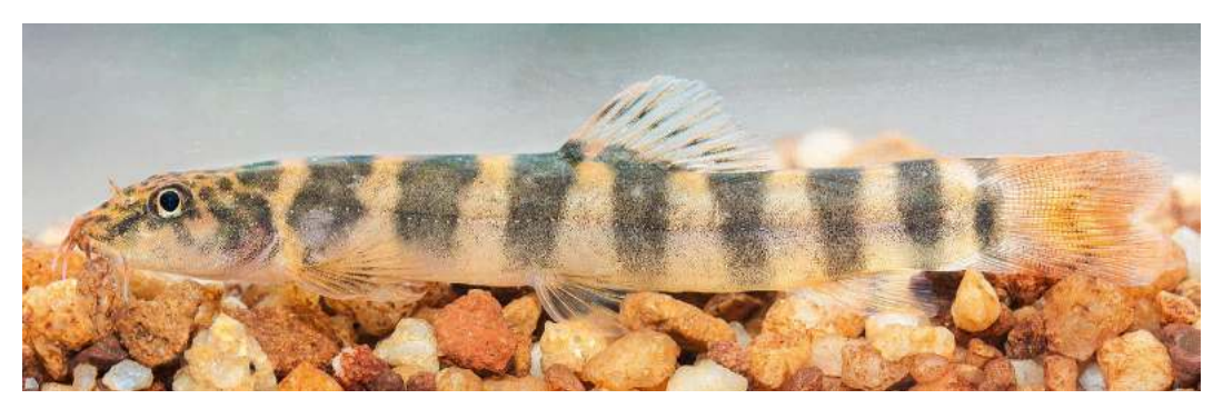
Fig. 1. Schistura kampucheensis , ZRC 54440, paratype, 37.3 mm SL; Cambodia: Kampot province: stream Ta Da Ou Bey; shortly after capture.

as well as freshly collected material. According to their description, S. spiloptera differs from the Cambodian material described by Kottelat (1990) by having 9+8 (vs. 8+8) branched caudal-fin rays, 8 (vs. 7) pelvic-fin rays, a plain (vs. spotted or vermiculated) top of head and 56–100 (vs. 32–70) pores in lateral line. These differences suggest that the Cambodian species is not conspecific with S. spiloptera . Since no other name is available for it, we describe it here as S. kampucheensis , new species.