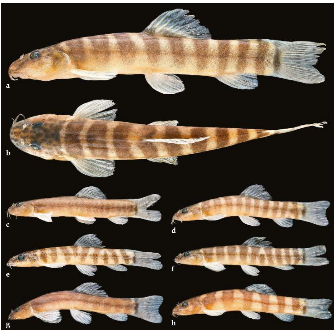
Fig. 2. Schistura kampucheensis ; Cambodia. a-f , Kampot province: stream Ta Da Ou Bey ( a-b , ZRC 54439, holotype, 43.9 mm SL; c-e , ZRC 54440, paratypes [ c , 36.2 mm SL; d , 33.5 mm SL; e , 21.4 mm SL]; f , CMK 24724, paratype, 30.2 mm SL); g , ZRC 54442, 37.5 mm SL; Kaoh Kong province: stream Thmor Rung; h , ZRC 54441, 36.3 mm; Kampot province: stream Anlong Kmeng Leng.

Description. See Figures 1–2 for general appearance and Table 1 for morphometric data of holotype and 31 paratypes. A relatively small nemacheilid loach with elongated body (body depth 6.2–7.5 times in SL). Body slightly compressed, caudal peduncle compressed. Maximum body depth at dorsal-fin origin, dorsal outline between nape and dorsal-fin origin nearly straight. Head slightly depressed. Snout round or slightly pointed in lateral view. Depth of caudal peduncle 0.9–1.3 times in its length. Axillary pelvic lobe