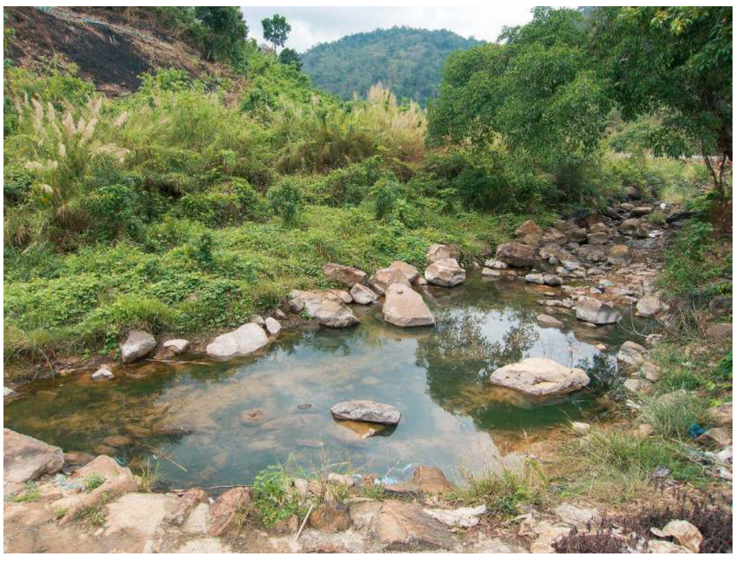
Fig. 4. Stream Ta Da Ou Bey in Kampot province, Cambodia. Type locality of Schistura kampucheensis. View upstream and to northwest.

southern Cambodia (Fig. 5). Rainboth (1996) listed the species from the Tonle San and tributaries. It seems that S. kampucheensis is distributed over a large part of Cambodia, but has up to now not been reported from any other country.