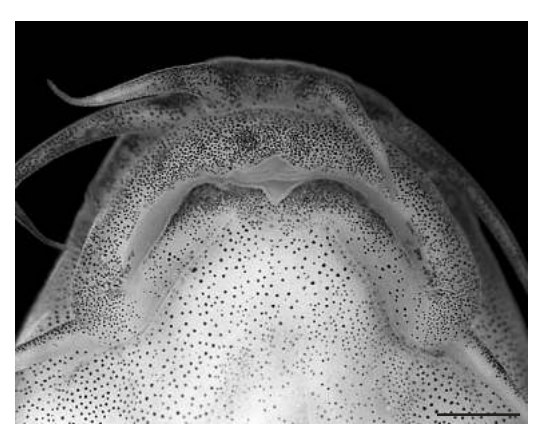
Fig. 3. Schistura kampucheensis; ZRC 54439, holotype, 43.9 mm SL; mouth. Scale bar 1 mm.

beyond half of distance to anal-fin origin and beyond anus, which is situated slightly posterior from mid-distance between pelvic-fin base and anal-fin origin. Pectoral fin with 10 rays, exceeding half of distance between bases of pectoral and pelvic fins.