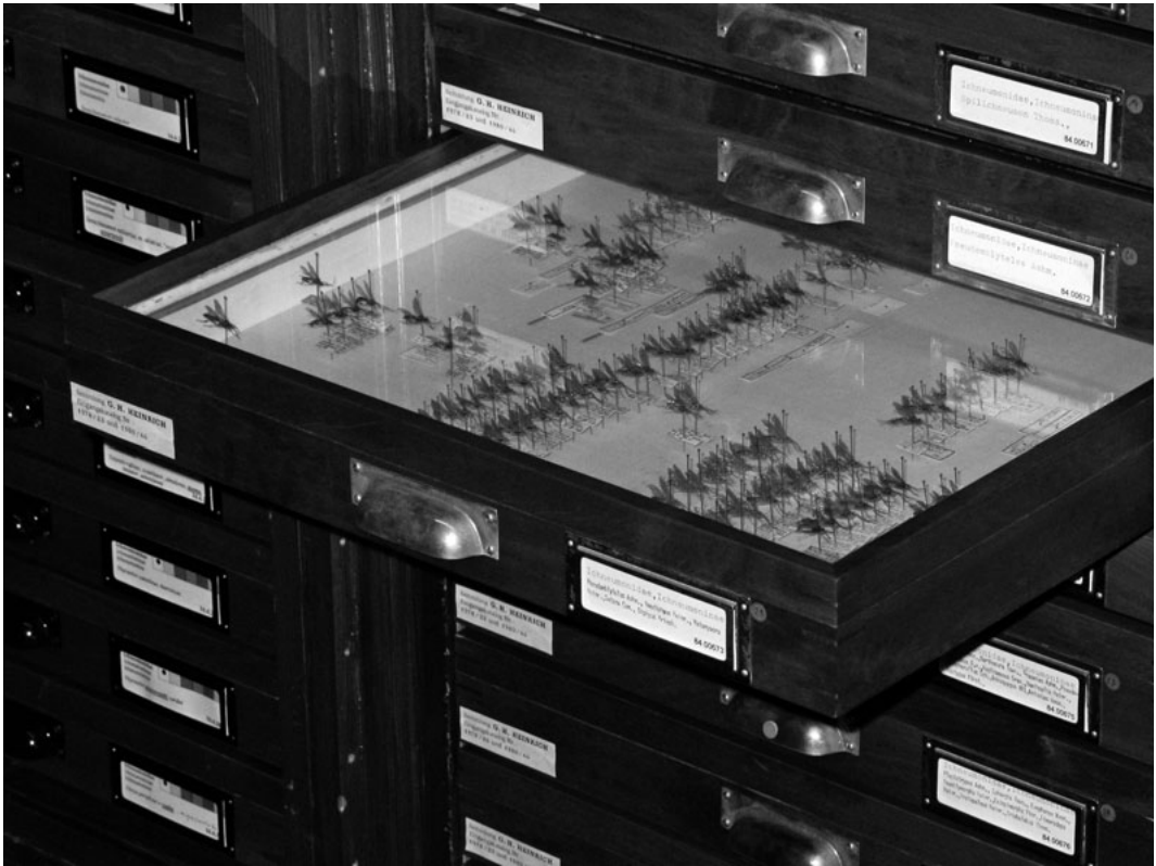
Fig. 2. Part of the Gerd Heinrich collection in the ZSM.

the ZSM type number on a separate label (Fig. 4). Sometimes the collecting date is neither mentioned in the original description, nor is it given on the label. The last paragraph gives the currently valid name of the species or subspecies. Information between square brackets was taken from other sources. See Yu et al. (2005) for additional information about taxonomy, distribution, biology, and literature citations.