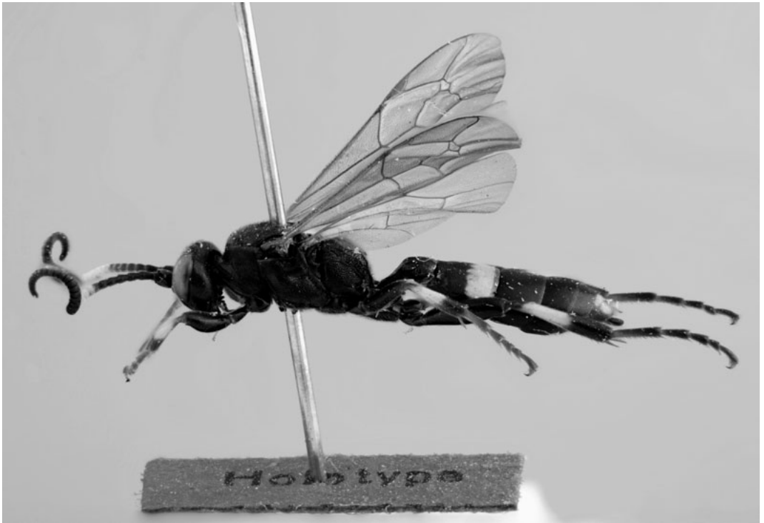
Fig. 1. Female holotype of Ichneumon feriens Heinrich. Typical preparation of an Ichneumon specimen by Gerd Heinrich.

the systematics of the birds of Angola (Weems 1977). The Heinrich collection of the ZSM is by far the most important collection of Ichneumoninae in the world, including numerous types and about 23,000 thoroughly mounted and accurately labelled specimens. All specimens are mounted on pins (Fig. 1) with wings usually directed upward and legs arranged more or less symmetrically.